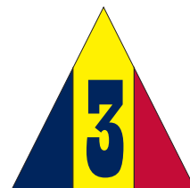
Achievement Badges 成就章