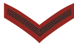
Cadet Lance Corporal 學員下士