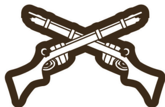
Marksman Badge (Full Bore) 優異射手章(實彈射擊)