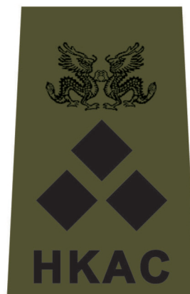
Honorary Brigadier 榮譽准將