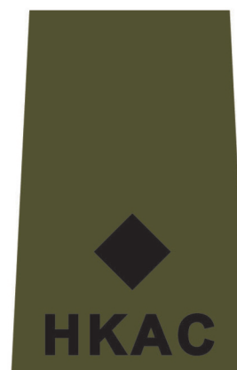
Second Lieutenant 少尉