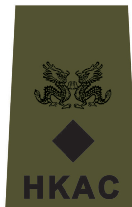
Lieutenant Colonel 中校