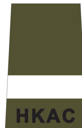
Officer Cadet 見習長官