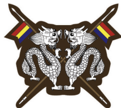
Guard of Honour Badge 儀仗隊隊員章