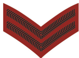
Cadet Corporal 學員中士