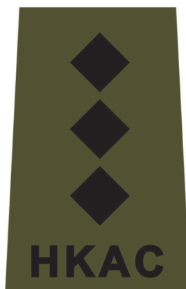
Honorary Captain / Captain 榮譽上尉 / 上尉