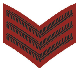
Cadet Sergeant 學員上士