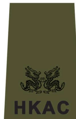
Honorary Major / Major 榮譽少校 / 少校