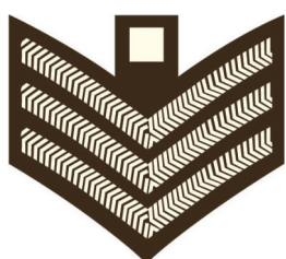
Staff Sergeant 特級上士